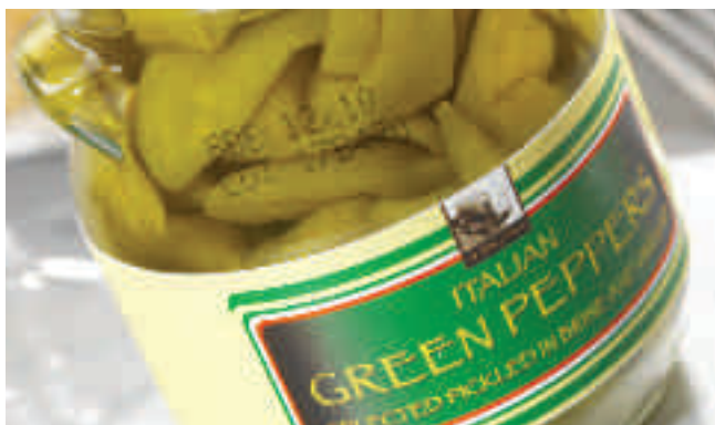
Print variable data for full traceability

A-Series plus networking capabilities allow remote monitoring without the need for special software.