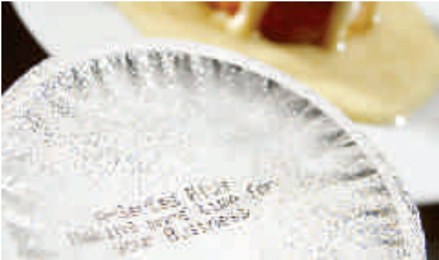
Up to 4 line coding in wash down environments

The Domino A-Series plus range of continuous ink jet printers delivers proven performance and high reliability ranging from basic coding applications through to those requiring networking capabilities and the highest print quality in the harshest production environments.