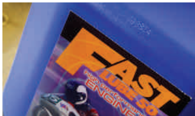
High contrast inks for dark surfaces