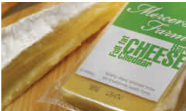
Wide variety of inks to suit modern packaging materials

The A-Series plus offers unrivalled reliability and connectivity, delivering a coding solution that provides increased production efficiencies by addressing the most common and important sources of manufacturing productivity loss.